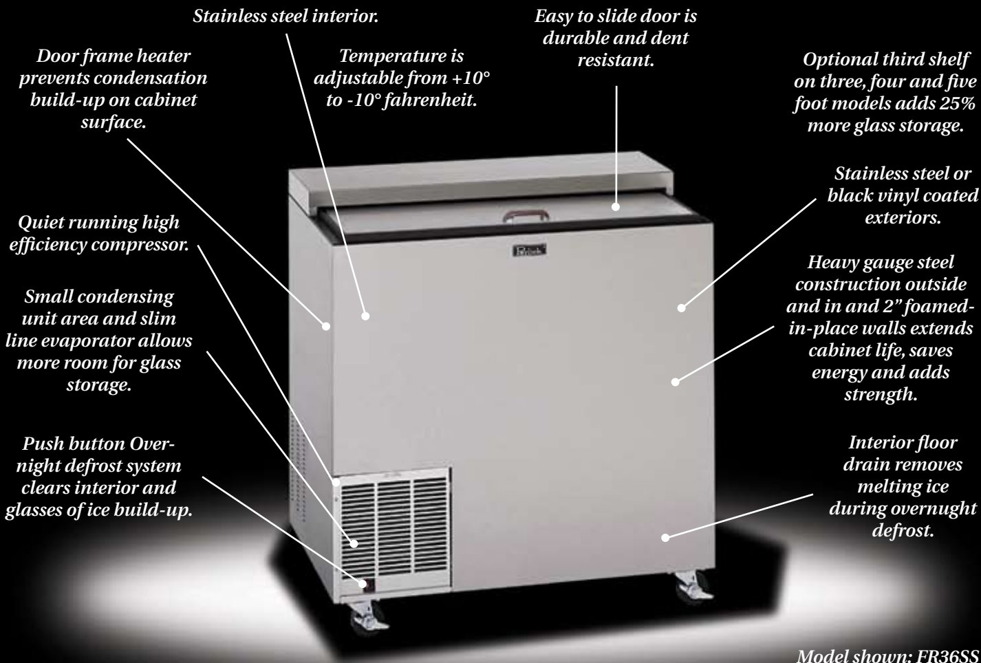
Model shown: FR36SS

Perlicks FR and BC series glass frosters and bottle coolers carry on the tradition of excellence that you've come to expect from Perlick. Thick wall construction and the use of heavy gauge metals throughout make these cabinets as durable as any Perlick cabinet ever made. High efficiency compressors combine with more